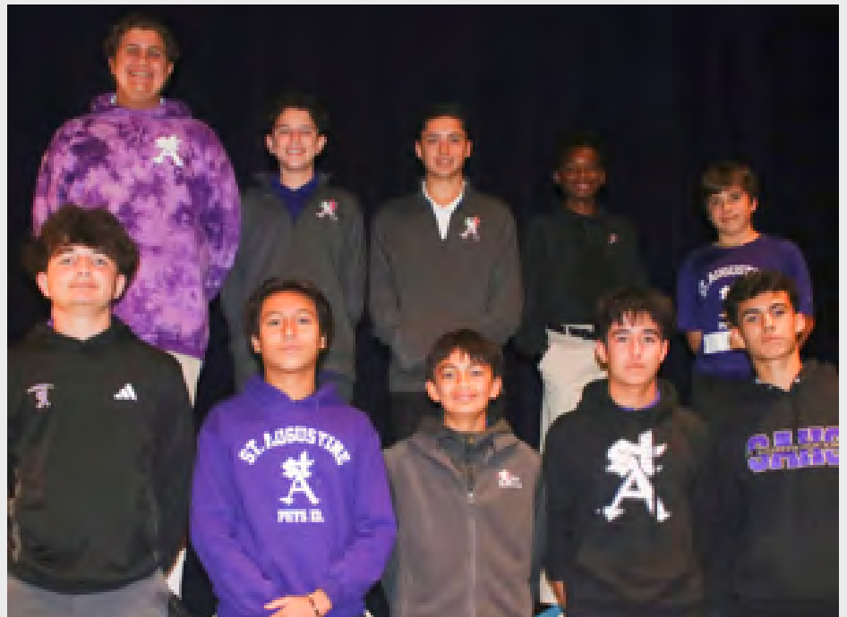
Pictured: Frosh Officers and Pit Leaders.

Congratulations to all members of the Frosh Leadership team for stepping forward and setting a proud example for the Class of 2029.