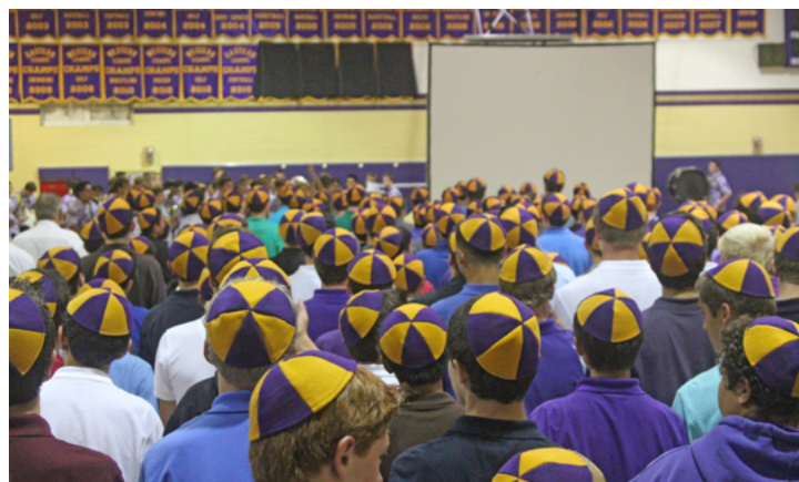
BEANIE SEASON. Here is an archive photo of Beaniemania assembly in the old Dougherty Gymnasium (circa 2010).