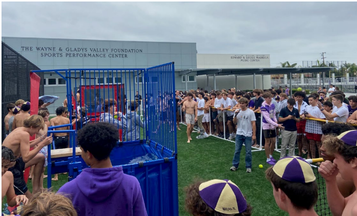
Water day activities filled the afternoon for Seniors and their Freshman brothers including dunk tanks, a water balloon fight and inflatable water slides.

Each year, except for those unfortunate Pandemic years, organizers of Frosh Welcome Week worked hard to out do previous years when it comes to crazy ideas to welcome Freshman brothers to the fun side of school activities. This year's theme Wacky and Wet fit right in with the school's traditional Costume Week and week-long Beanie activities.