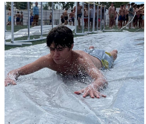
Saintsman water sliding during Frosh Week.