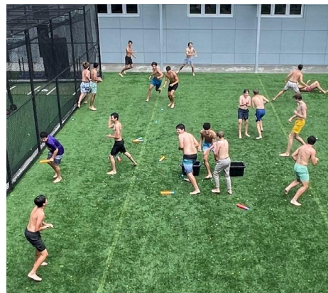
Water balloon battle breaks out.