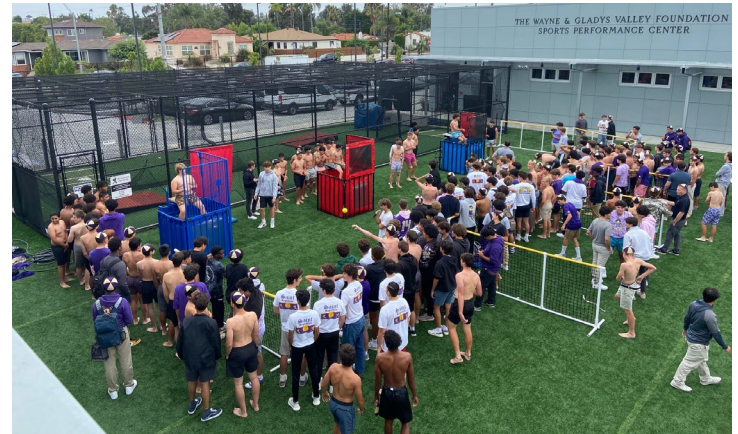
No shortage of volunteer dunkees in this Frosh Week scene awash with beanies.