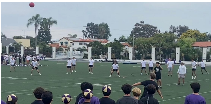
Frosh player kicks one deep to left field in this kickball game of Seniors against Freshman during the Senior/Frosh Field Day Games.