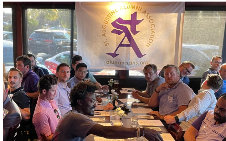
ALUMS IN ACTION. School grads packed Pueblo Restaurant in Pacific Beach to attend a recent meeting of the St. Augustine Alumni Professionals Network.