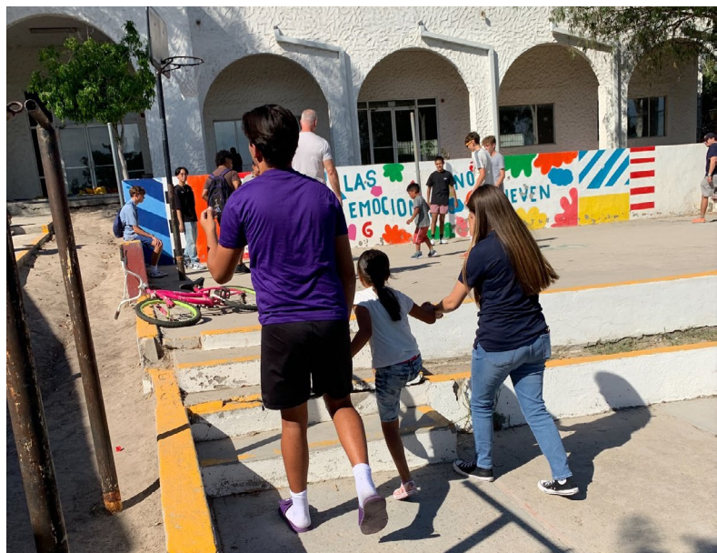
For visit info contact Saints Christian Service office.