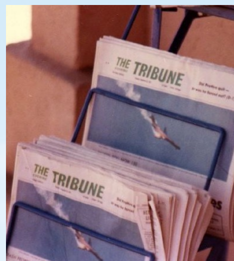
The Tribune won a Pulitzer Prize for its coverage of the tragedy.