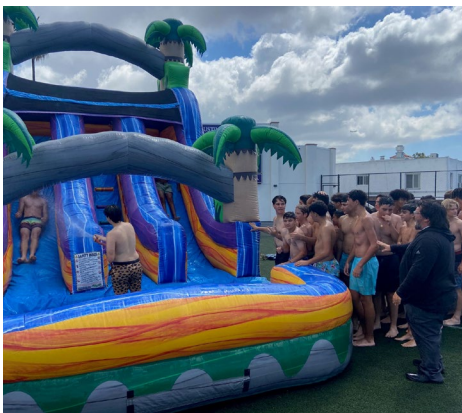
Water, water everywhere.