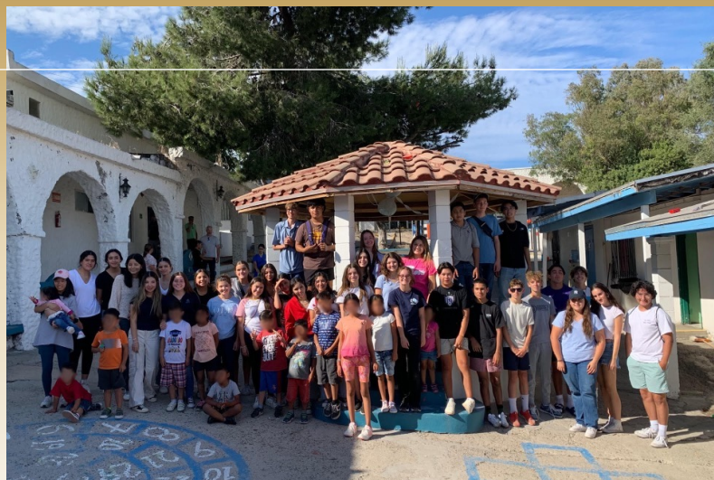
Tijuana’s Casa Hogar La Gloria was founded in 1975.