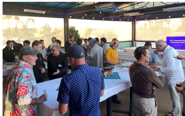
NET WORKING. For a list of upcoming events and to get involved, visit https://alumni.sahs.org/

Here are more ways to connect via two big events this Fall: