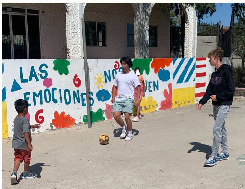
For visit info contact Saints Christian Service office.