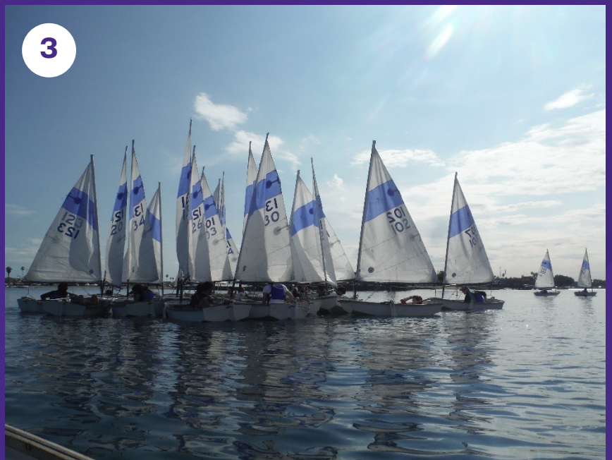
3. Aquatic Sports on Mission Bay