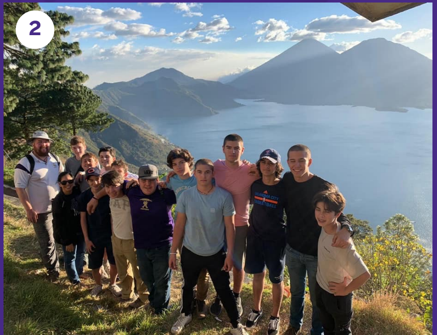
2. Guatemala Travel Mission San Lucas Toliman, 2020