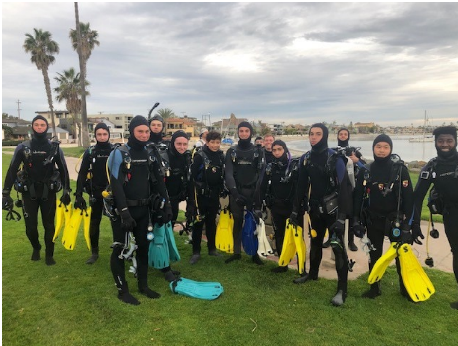
MARINE BIOLOGY. Scuba diving, La Jolla.

See more intersession photos on page 18.