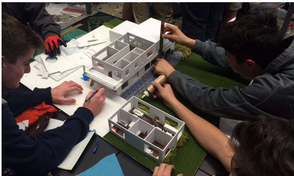
TO SCALE. Architectural Design, 2016.