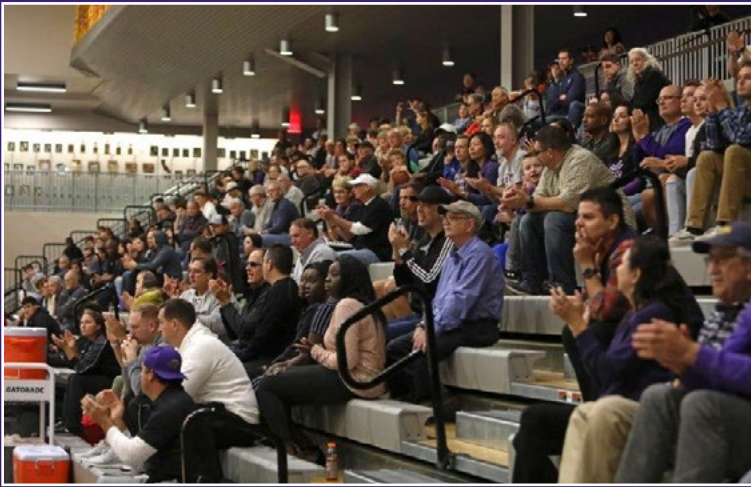
Early round of Torrey Pines Holiday Classic Prep Tournament was held in Saints new gym.