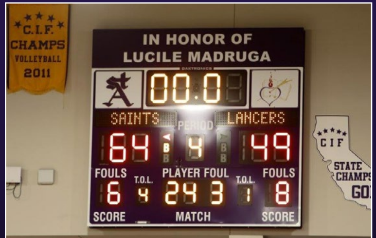
New scoreboard in Saints Gym. Saints at this point was 11-1.