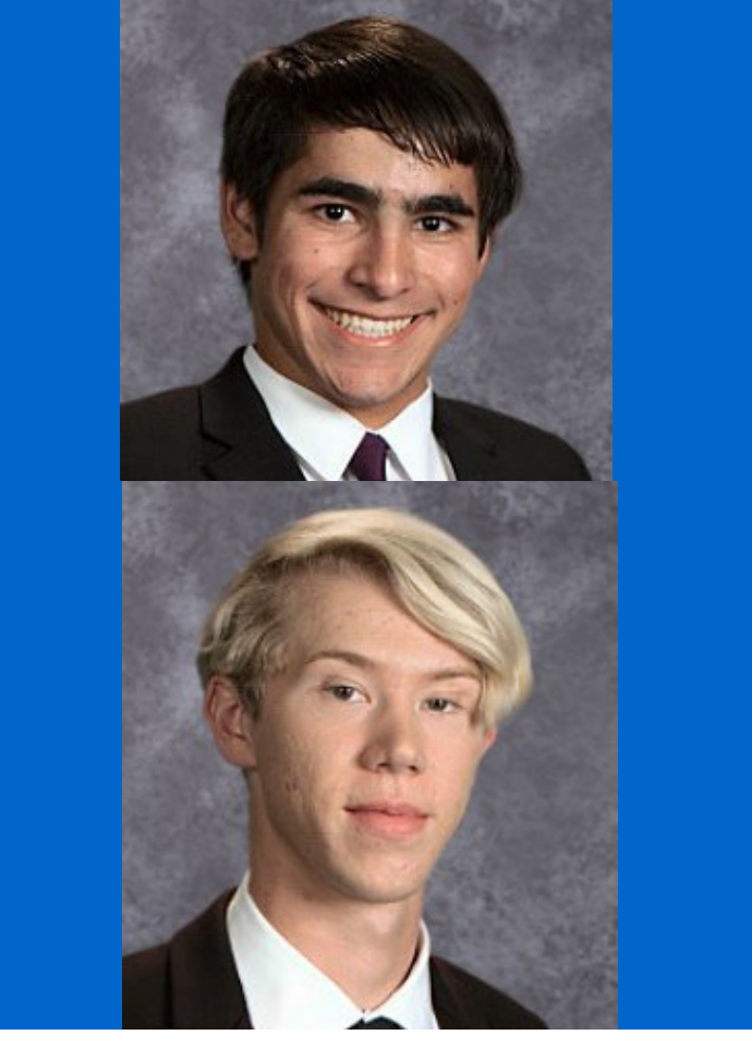
Four seniors earned the title of National Merit Scholarship Finalist.