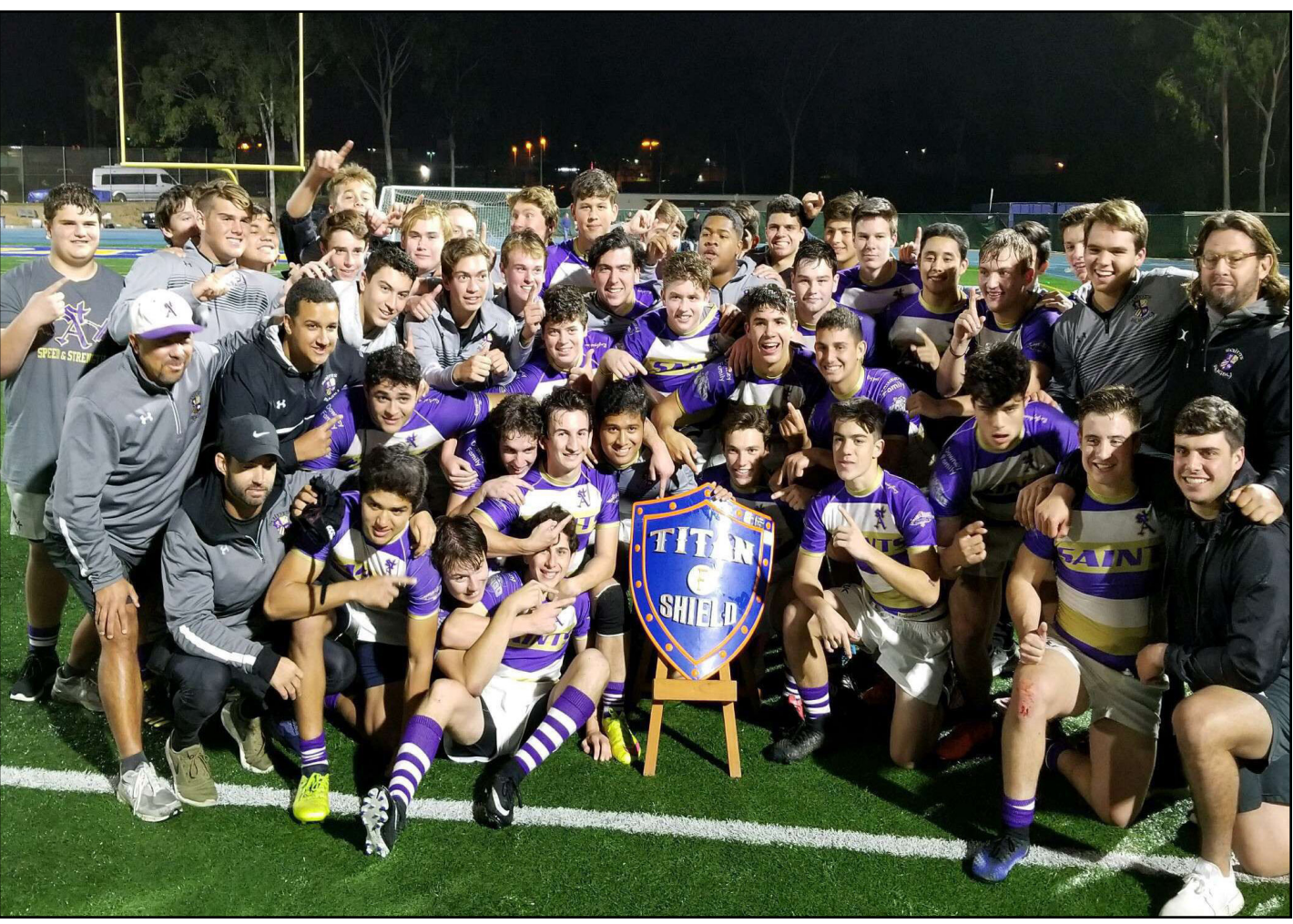
The rugby team celebrates a decisive win against La Costa Canyon.

"Southern California has one of the best rugby programs in the nation. We are very proud to be competing for the top places. It really shows how good of a team we have,"