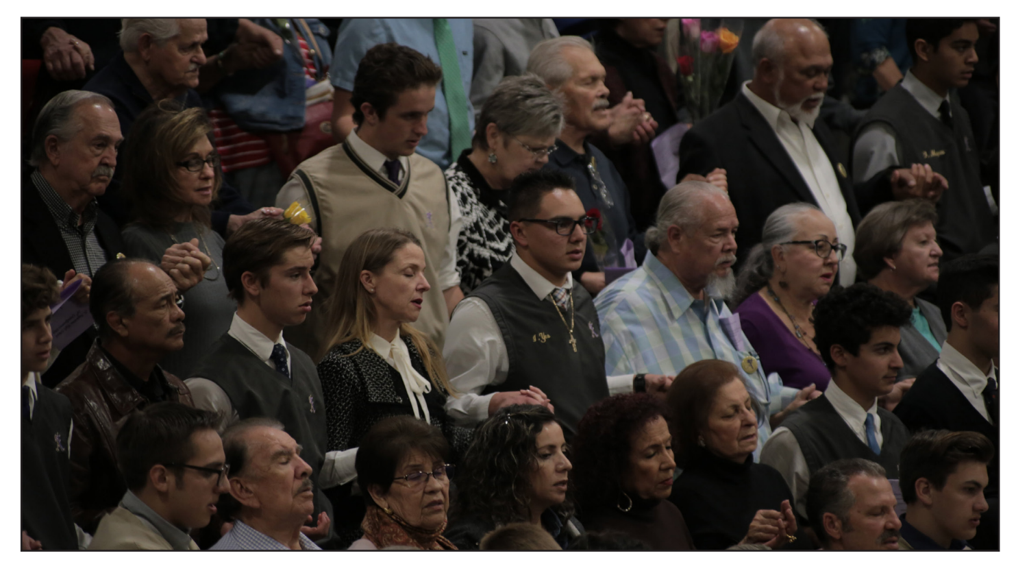
A gathering of granparents graced the grounds of campus for brunch and Mass.