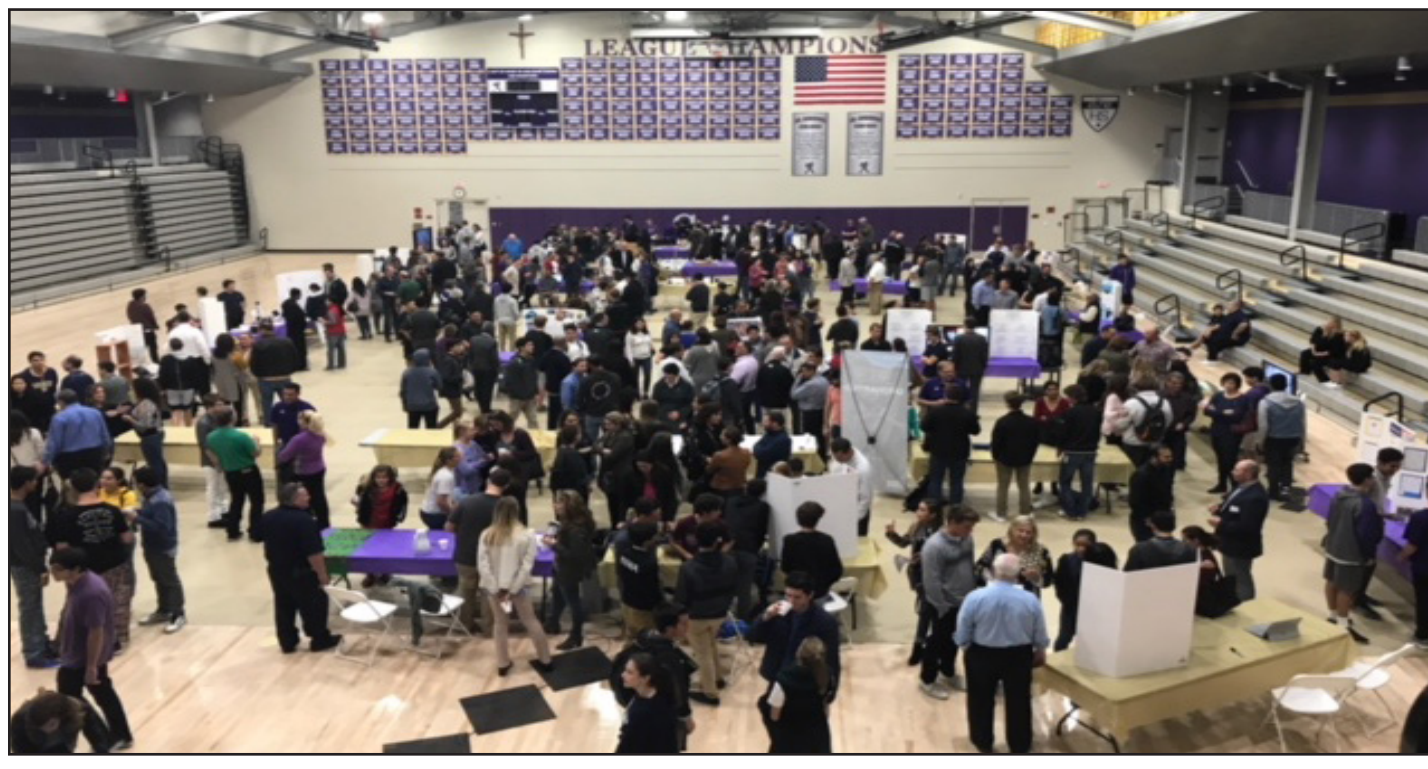
The Intersession Expo returned to campus this year in the Commons.

Intersession also offered an opportunity for the speech requirement to be fulfilled, and thus it was installed as a freshman course. For seniors it started as an opportunity for internships at various places of work. At first not all interned, but now the vast majority do. For the rest of the student body, intersession became a break from academics and a chance to grow in ways that are not strictly academic.