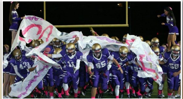
Saints Varsity roars on to the field