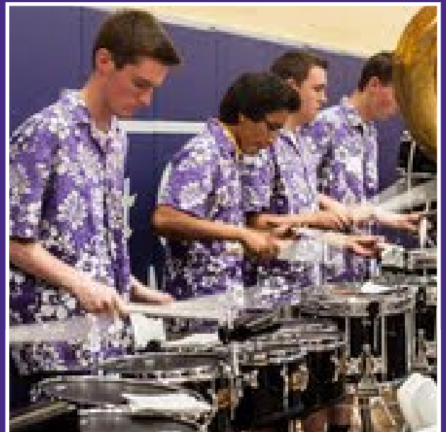
Saints popular drumcorps is part of the school's music program