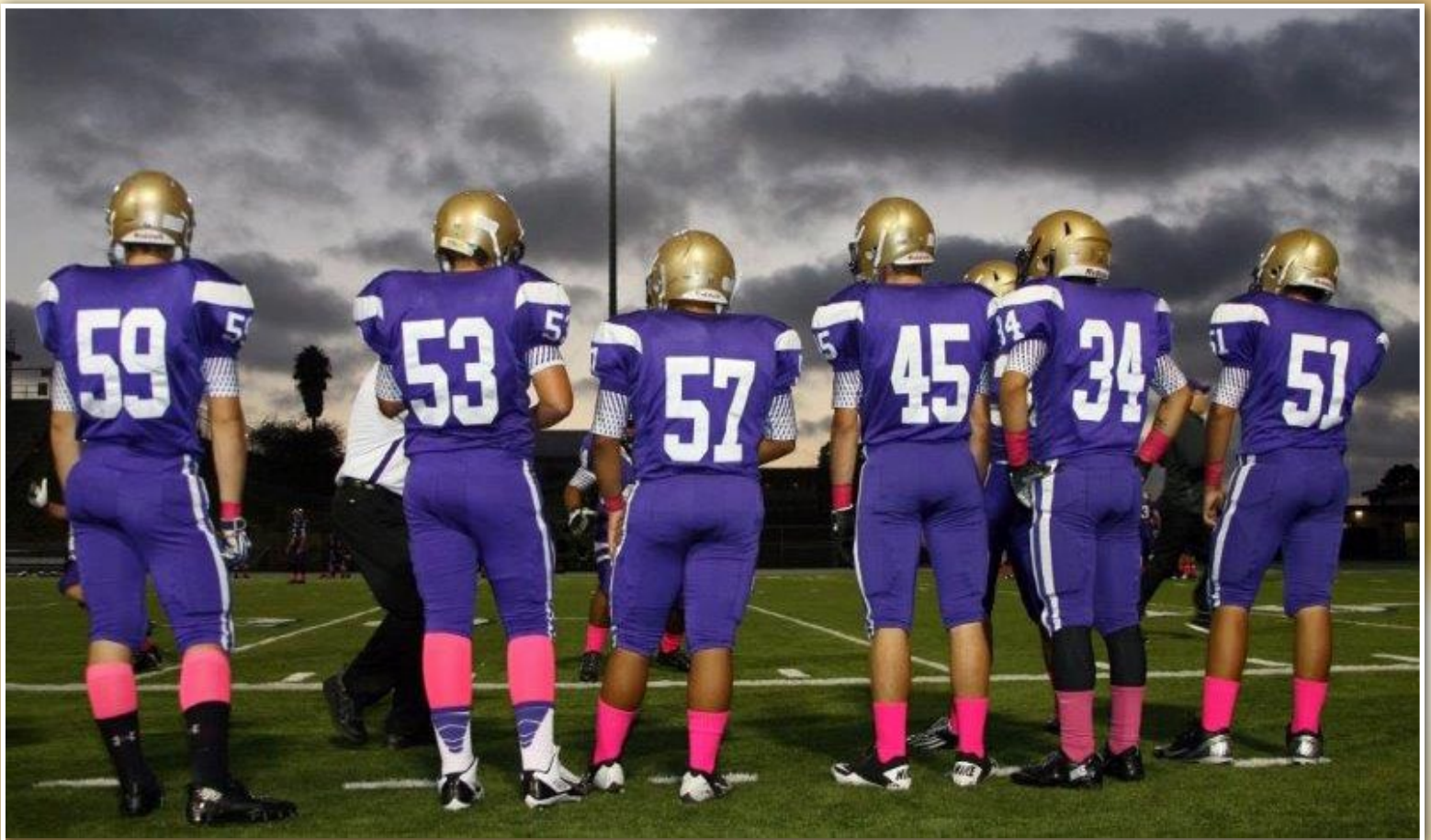
In honor of American Cancer Society's Breast Cancer Awareness month, Saints Varsity donned pink socks.