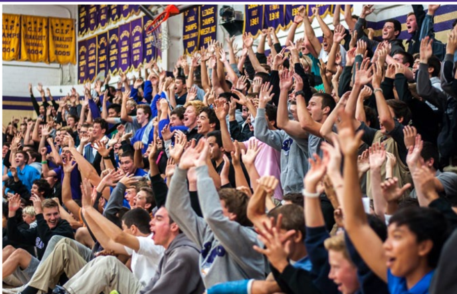
Boyz making noise