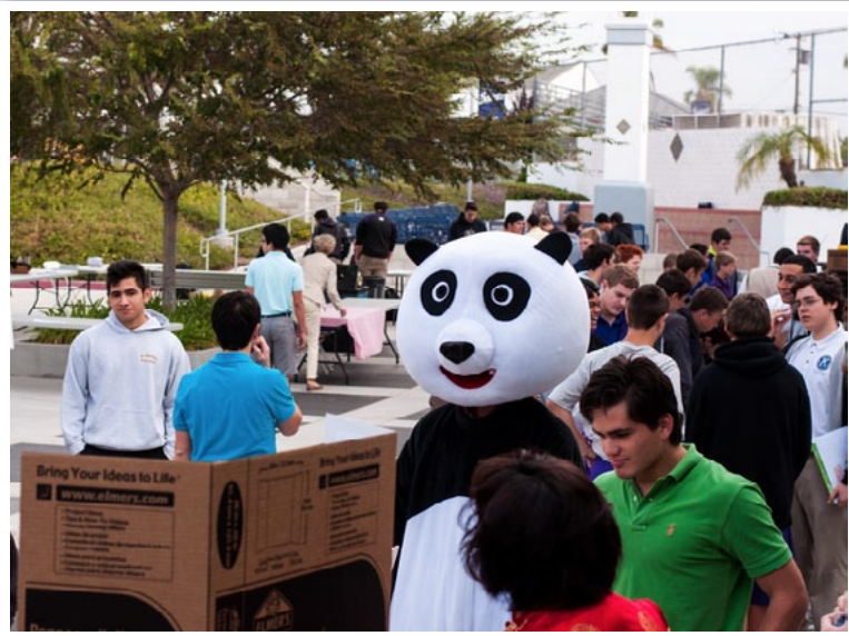
Panda mascot was part of the school's Chinese Club Club Day booth.