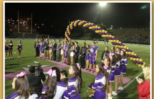
Homecoming ceremony at half-time during the Saints vs. San Diego High game.