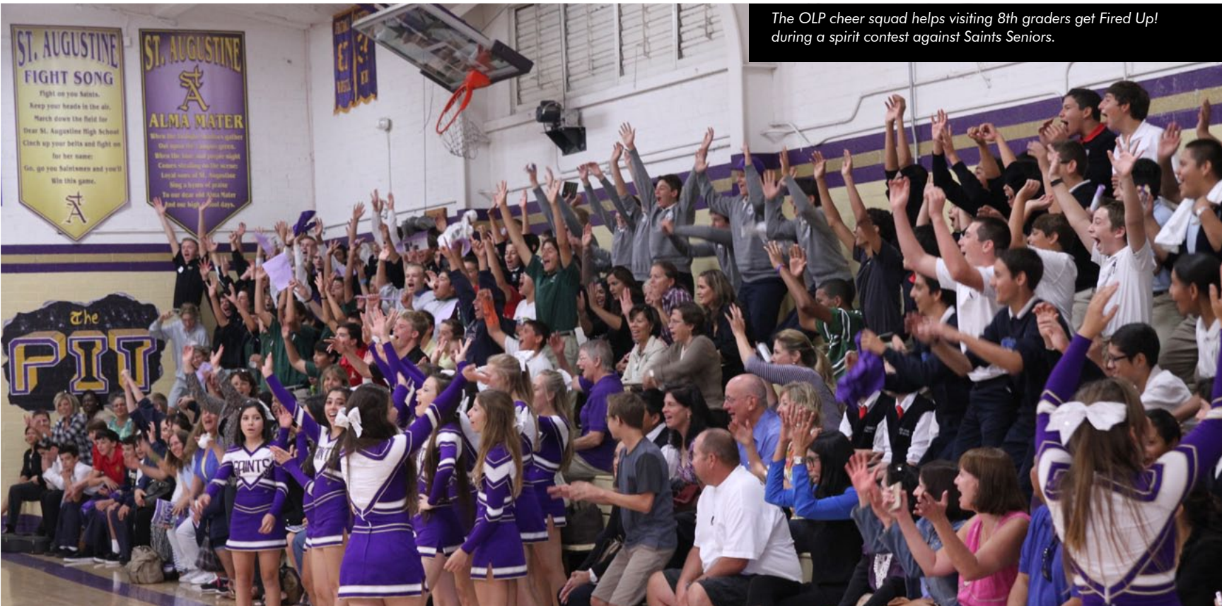
The OLP cheer squad helps visiting 8th graders get Fired Up! during a spirit contest against Saints Seniors.