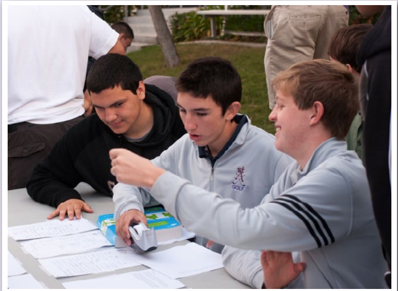
Officers of the newly formed Investment Club gather dozens of membership sign-ups during ASB club day.

A PORTION OF THE PROCEEDS FROM ALL SAINTS TICKETS WILL BE DONATED TO INTERNATIONAL RESCUE COMMITTEE