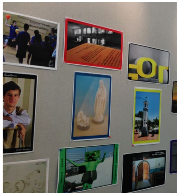
LOBBY GALLERY —Recently showcased artwork on the main office lobby gallery wall included the work of talented Saintsmen from Digital Photography Class, blocks 4 and 6 taught by Mr. David Knoll, PPA Master of Photography.