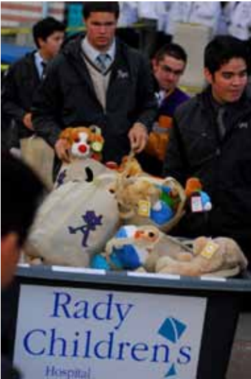
Saintsmen stuff nurse's carts with Teddy Bears