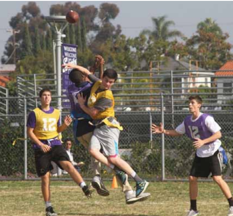
Action was fast and furious as seen in this pass play mixup.