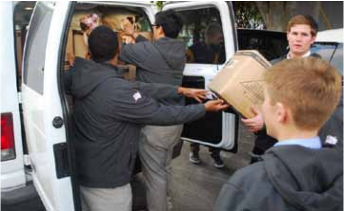
Saintsmen haul out a van loaded with Teddy Bears into the warehouse at Children's Hospital