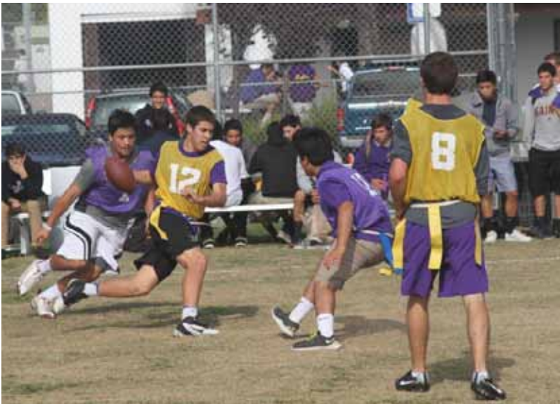
Intramural programs, like this 51st annual championship game, occur during lunch.