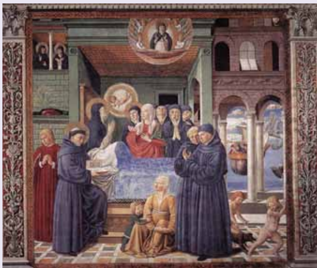
"Death of St. Monica" by Benozzo Gozzoli was completed in 1465. It is a fresco at the Apsidal Chapel of Sant' Agostino, San Gimignano, Italy.

Later he slept, and woke up to find that the rest had brought some relief from his sorrow. Gradually I began to recover my former feeling about her, recalling how loving and devout was her conversation with You, how pleasing and gentle her conversation with me, of which I was now suddenly deprived. I found comfort in weeping in Your sight about her and for her, about myself and for myself. I no longer tried to hold back my tears. I let them flow, making them a resting place for my heart. For it was Your ears that heard my weeping, and not the ears of a man, who would have misunderstood my crying and despised it. Thus Augustine mourned his mother and, true to her last request, ever afterwards remembered her at the altar of the Lord.